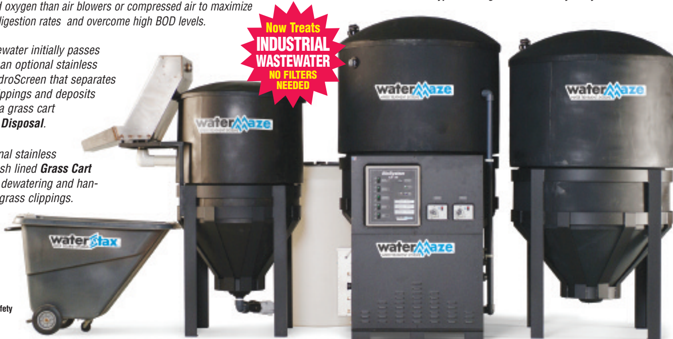
Optional cart for easy disposal of grass clippings